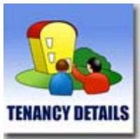
Tenancy Details – Set-up your tenancy agreements.