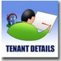
Tenant Details – Capture your tenant details.